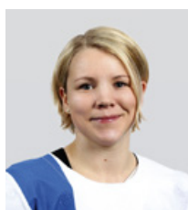
Emma Terho (Ice Hockey, Finland)