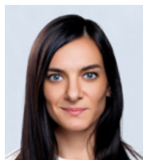
Yelena Isinbaeva (Athletics, Russia)