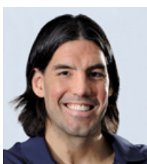
Luis Scola (Basketball, Argentina)