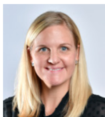
Kirsty Coventry (Aquatics, Zimbabwe) Chair