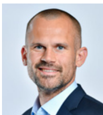
Stefan Holm (Athletics, Sweden)