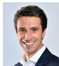
Tony Estanguet (Canoe, France)