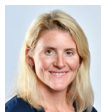
Hayley Wickenheiser (Ice Hockey, Canada)