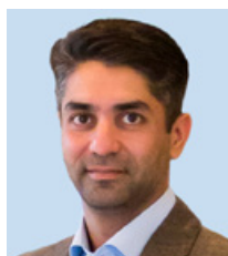
Abhinav Bindra (Shooting, India)