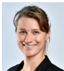
Britta Heidemann (Fencing, Germany)