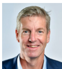
James Tomkins, OAM (Rowing, Australia)